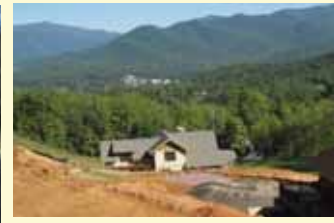
The curbing around The Settings of Black Mountain Clubhouse is complete. Third photo is a view of the pool area.

Asheville, North Carolina was named the #1 retirement town by Topretirement.com in 2007, it has just been named #1 on the list of 25 Best Places to Retire again for 2008!