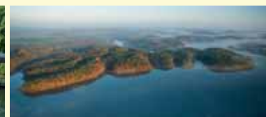
Aerial View of West Point Lake.

The Settings of West Point Lake - 866-980-5253 • The Settings of Mackay Point - 888-962-2529 The Settings of Lake Rhodhiss - 866-985-5253 • The Settings of Black Mountain - 866-832-5225