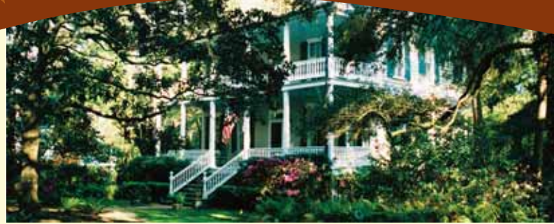
The streets of Beaufort are lined with Antebellum mansions like this one.

The Settings of Mackay Point is located only 30 minutes (22 miles) away from the town of Beaufort. Beaufort is a charming town which has recently been featured in several publications and on the internet.