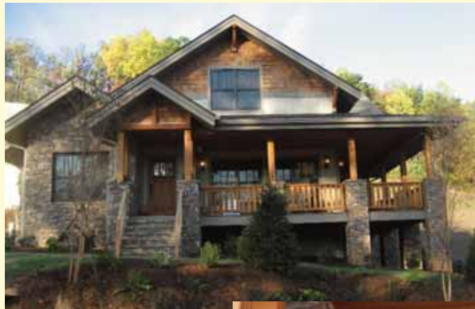
This 2,699 sq. ft. custom-built model home is for sale at The Settings of Black Mountain.