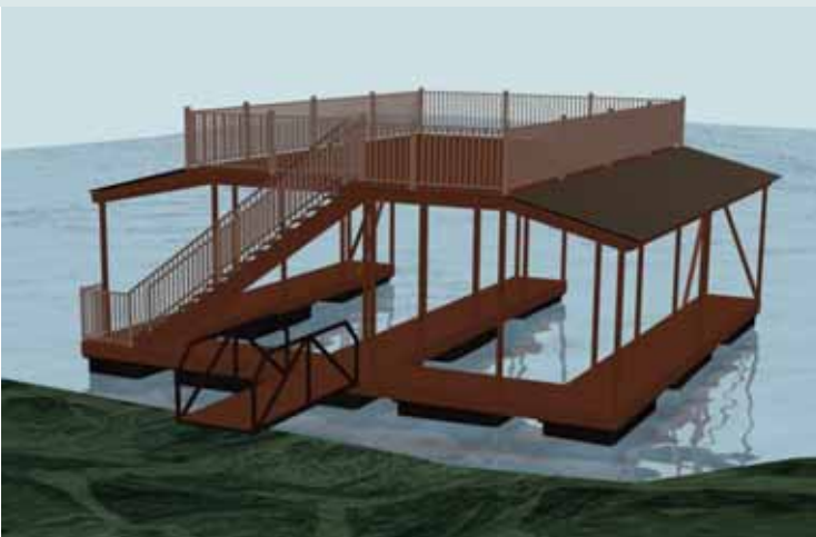
DOUBLE-SLIP DOCK WITH SUNDECK 28' long and 32' wide with two 10' wide slips