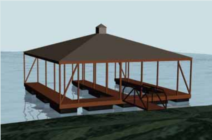
DOUBLE-SLIP DOCK WITH ROOF (No Sundeck) 28' long and 32' wide with two 10' wide slips