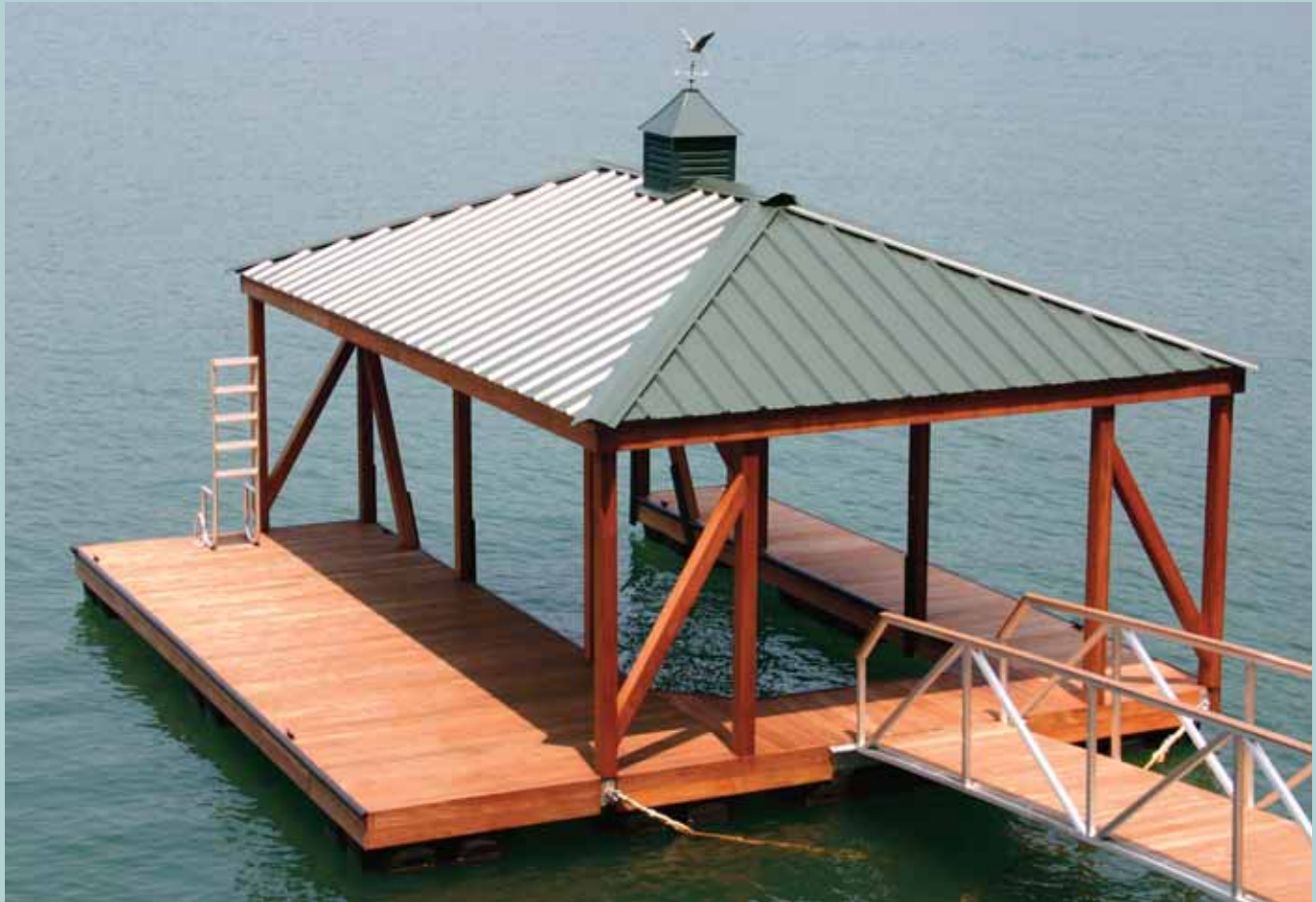
SINGLE-SLIP DOCK WITH SWIM PLATFORM 28' long and 24' wide with a 10' wide slip that is 24' in length

To preserve the natural beauty of the shoreline, The Settings of Lake Rhodhiss has established four styles of docks, as referenced in the community's Covenants, Conditions & Restrictions guidelines (CCRs). Each of the four styles is designed to blend naturally with the environment that surrounds the dock. All dock construction and permitting on Lake Rhodhiss falls under the jurisdiction and guidelines set forth by Duke Energy.