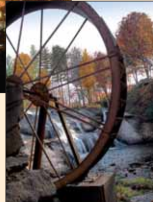
The mill may not grind corn, but it's still picturesque enough to inspire the imagination.